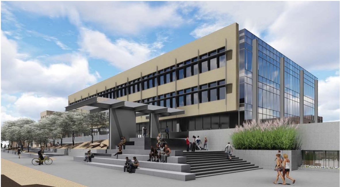
Remodel Concepts East Elevation Design: RMKM Architects