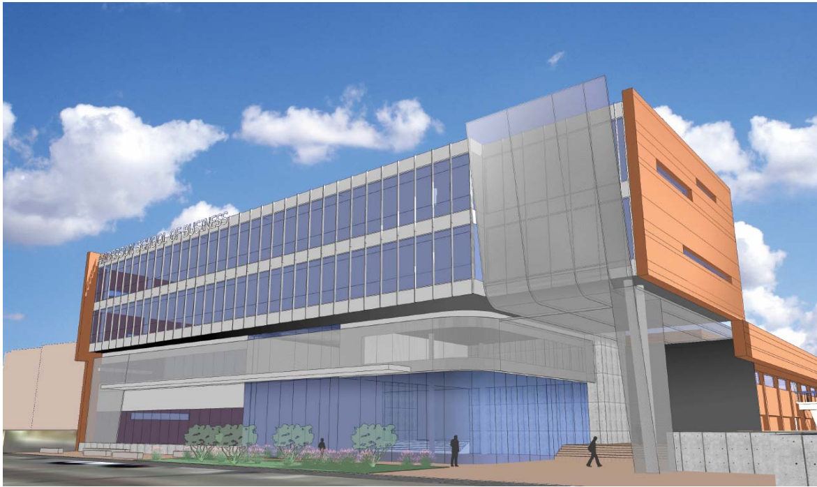
Proposed Anderson School of Management Replacement