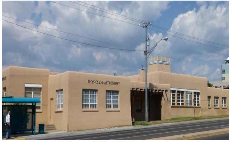
(Location of new Building)