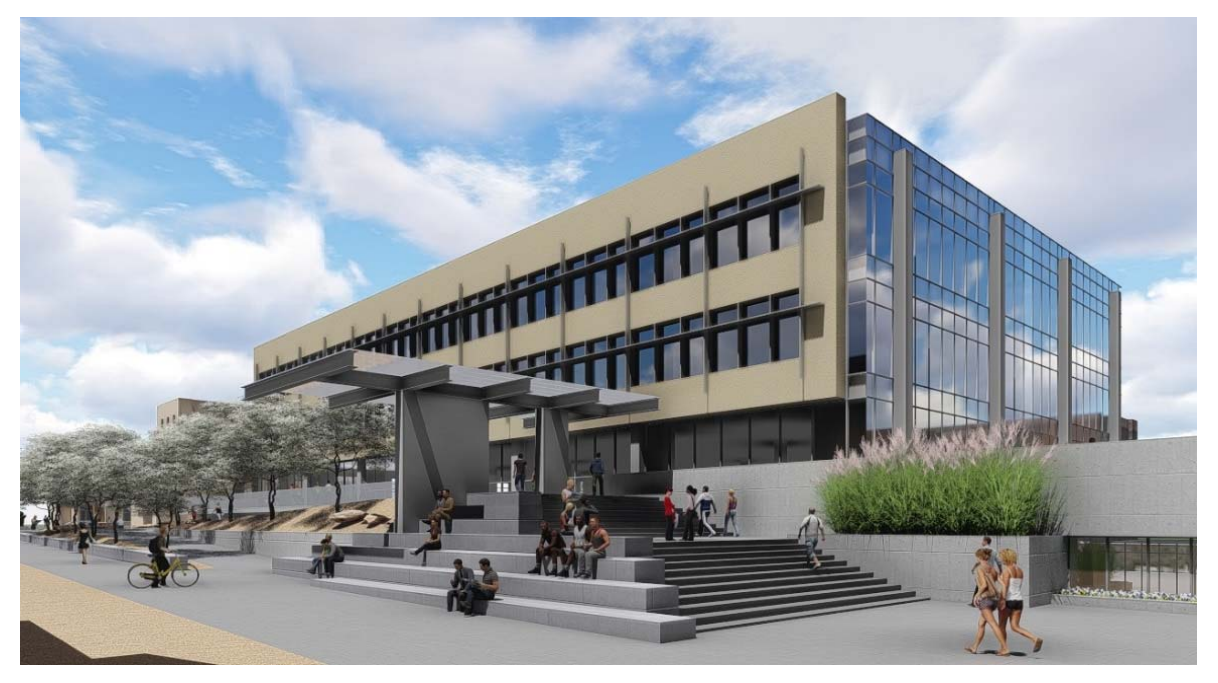
Remodel Concepts East Elevation Design: RMKM Architects